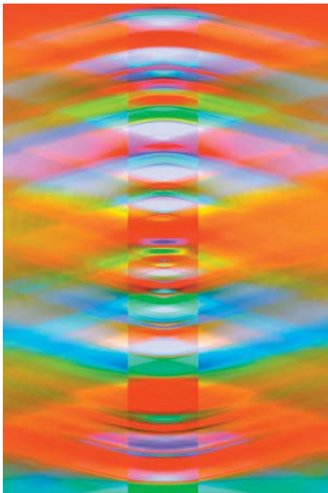
Totem, 2005 Digital chromatic study Series Lumenations